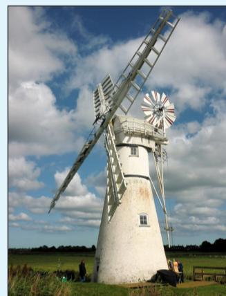
Set sail: A windpump at Thurne.