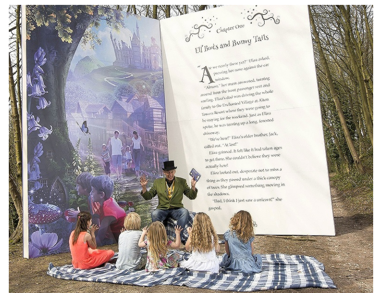
■ Youngsters enjoy 'the world's largest children's book' at the launch