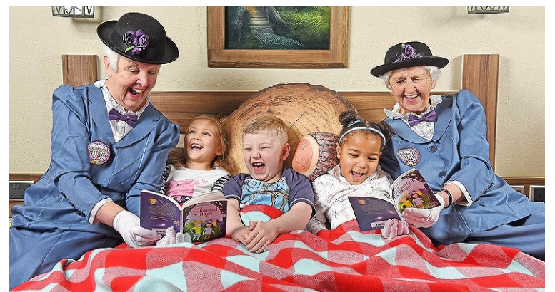
■ Insta-Gran – the world's first granny bedtime reading service