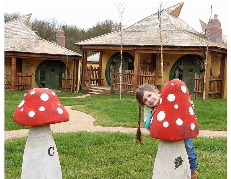
■ Cerys Caffery, four, enjoying The Enchanted Village at Alton Towers

Prices for Woodland Lodges start at £117 for two adults and £157.50 for five adults, which works out at £31.25 per person per night when booked in advance at altontowers.com, representing some of the cheapest accommodation at the resort.