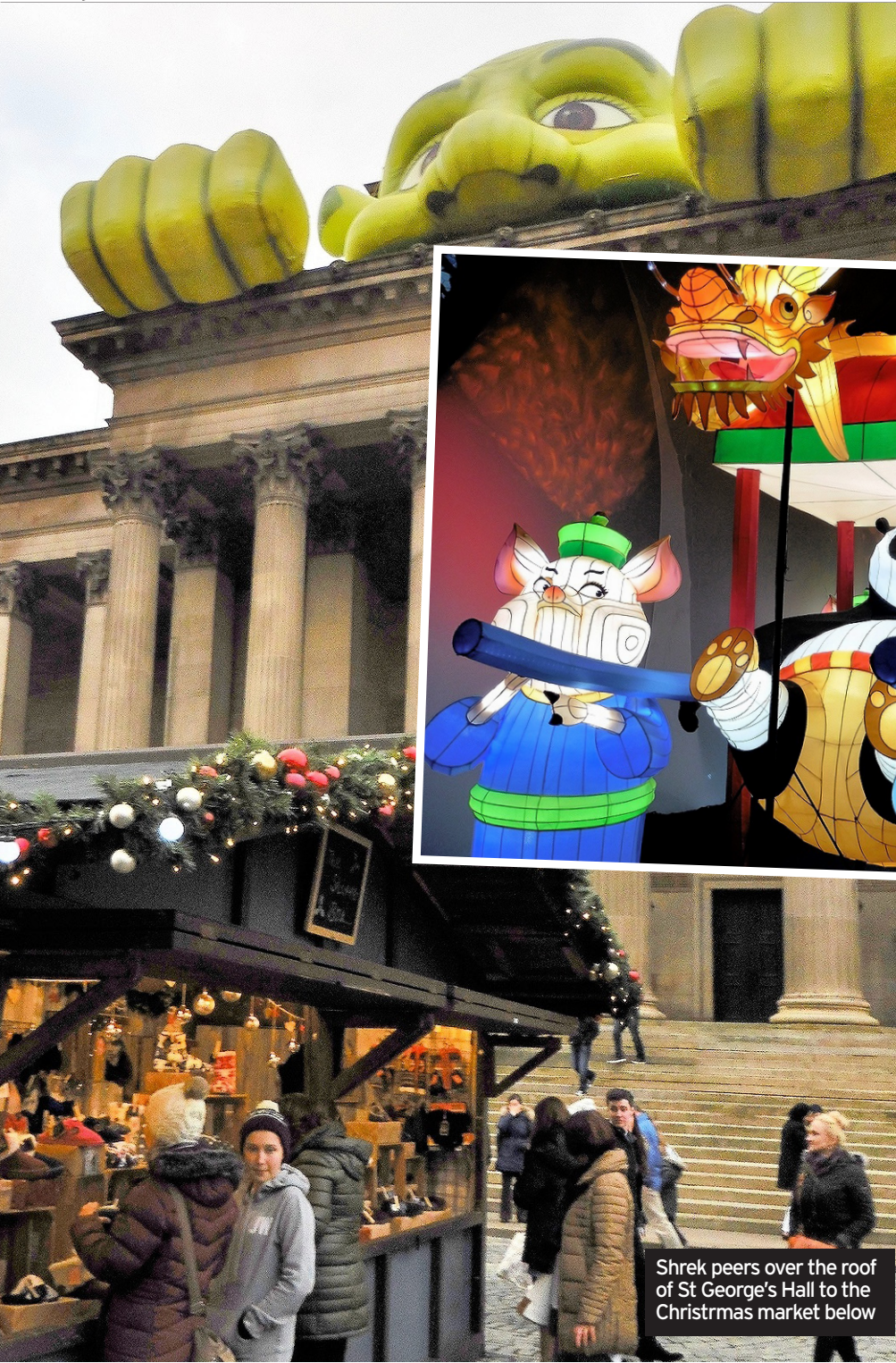
Po the Kung Fu Panda in one of the many scenes at DreamWorks Lights

Close to the Christmas tree in Liverpool ONE is a train made entirely of LEGO bricks – half a