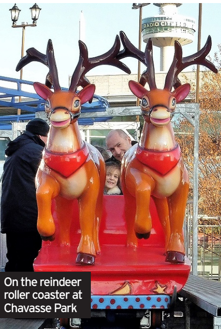
On the reindeer roller coaster at Chavasse Park