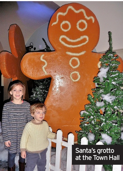
Santa's grotto at the Town Hall