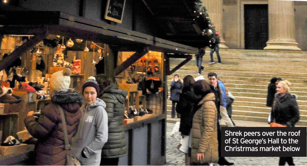
Shrek peers over the roof of St George's Hall to the Christmas market below

million of them. It's being driven by an elf and the two carriages are filled with presents and a Christmas tree. There is no need to book tickets to this train, children can just join the queue to climb inside the driver's cabin for a free photo opportunity. Until December 29.