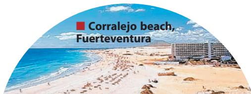
■ Corralejo beach, Fuerteventura