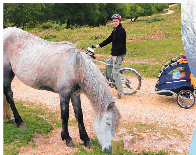
■ Left, a holiday lodge at Sandy Balls and wild ponies found in the New Forest