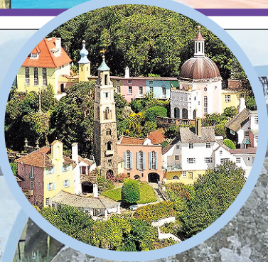
■ Gelert’s grave in Beddgelert, the Llanberis Lake Railway and Portmeirion

home to lots more eco-friendly fun including karts, canoes, treehouses, a barefoot trail and the longest sledge run in Wales. On the Sunday we went to church, as you do. This was no ordinary church, though. No prayers or hymns, but it was a heavenly place for Cerys. The church in question has been turned into The Fun Centre, an enormous soft play area in Caernarfon. There are the usual ball pools and rope bridges but what really separates the toddlers from the teens here are the 25ft drop vertical slides. They are such a thrill that the centre hosts adults-only evenings. No break in Snowdonia is ever complete without a visit to the fairytale village of Portmeirion. The mix of contrasting classical, palladian, arts & crafts and gothic styles somehow gel perfectly. With its fountains, grotto, lighthouse and Italianate bell tower, it’s a magical place. Our guide regaled us with tales of celebrities who have stayed in the self-catering cottages, including George Harrison, Brian Epstein and Noel Coward, who wrote Blythe Spirit in five days there. And he told us how the pet cemetery was established by one of Portmeirion’s eccentric tenants, who preferred the company of dogs to humans and read The Bible to them from behind a screen. Unlike in Gelert, there’s no reason to suspect they were sent to doggy heaven with the errant thrust of a sword.