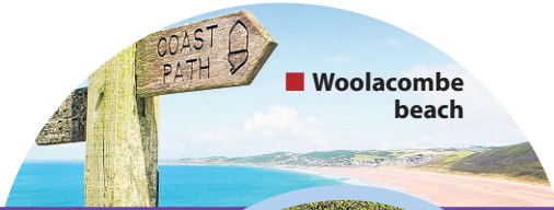
■ Woolacombe beach

► ENJOY a two night break in Devon, price £50 per person, based on four sharing, at Woolacombe Bay Holiday Parks, from August 23. Call 0843 208 0368 or click www.woolacombe.com/bp