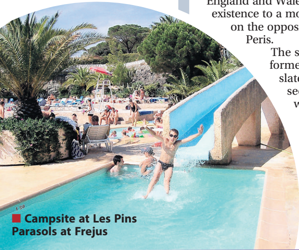
■ Campsite at Les Pins Parasols at Frejus

► SPEND August Bank Holiday camping on the Cote d’Azur for £265 (saving 10%). The deal on a seven-night getaway, starting on August 24, with Venue Holidays, includes a fully-equipped Espace tent sleeping two adults and up to four children at Camping Les Pins Parasols at Frejus, a campsite offering sporting facilities for all ages including a swimming pool. Ferry crossings can be arranged by Venue and cost, for example, £118 for a weekend P&O Dover/Calais saver ferry crossing for car and passengers. Call 01233 629950 or click www.venueholidays.co.uk