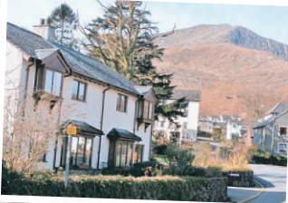
■ Coed Gelert cottages, right

► ENJOY a two night break in Devon, price £50 per person, based on four sharing, at Woolacombe Bay Holiday Parks, from August 23. Call 0843 208 0368 or click www.woolacombe.com/bp