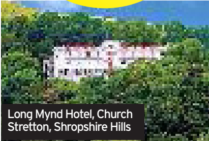
Long Mynd Hotel, Church Stretton, Shropshire Hills

LEADING walking and activity holiday provider, HF Holidays has launched its Blue Cross Sale with up to 30% off some of its most picturesque UK walking holidays.