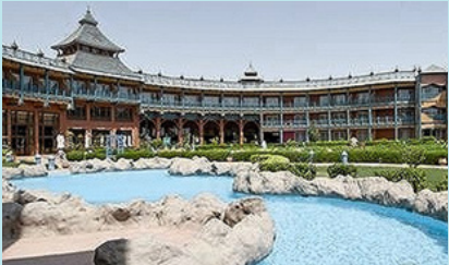
Dreams Beach Resort Marsala Alam Hotel