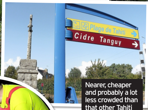
Nearer, cheaper and probably a lot less crowded than that other Tahiti