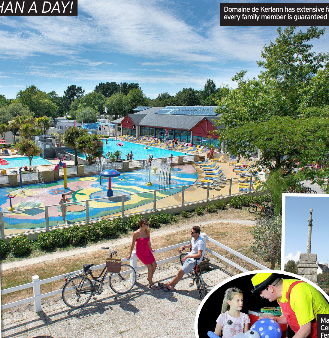
Domaine de Kerlann has extensive facilities, so every family member is guaranteed to have fun