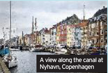
A view along the canal at Nyhavn, Copenhagen

YOU DON'T need to catch a plane to bask on the golden sands of Tahiti. You can get there by boat – and in less than a day