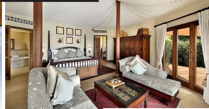
One of Al Maha's 'tented' suites

Yes, you need deep pockets to keep coming back, but if you've got a special occasion to celebrate, it's worth saving up for.