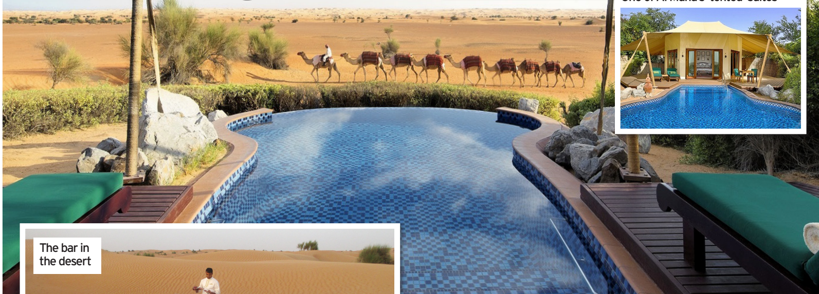
The bar in the desert

In return, the hotel is committed to the preservation and restoration of indigenous fauna, flora and wildlife, and 20 per cent of its income is ploughed into the reserve.