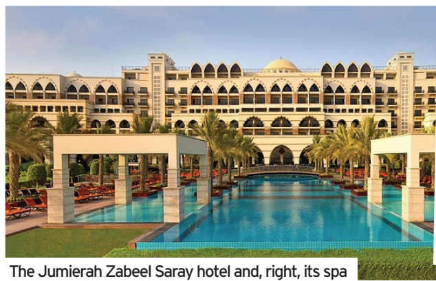
The Jumeriah Zabeel Saray hotel and, right, its spa