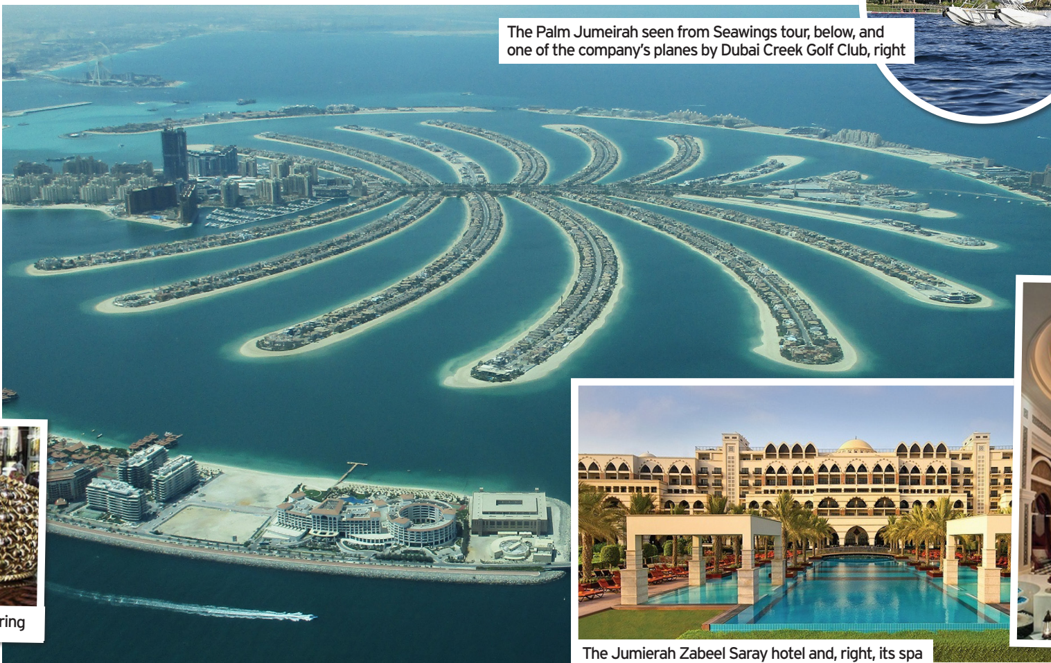
The Palm Jumeirah seen from Seawings tour, below, and one of the company's planes by Dubai Creek Golf Club, right

Golf Club with its huge, modernist club house inspired by the sails of a traditional boat. After our flight we took the short taxi ride to the gold souk in Deira which, with 100 shops, gives even Birmingham's Jewellery Quarter a run for its money. Amid all the bling you can't miss the Najmat Taiba (Star of Taiba) ring, which weighs 63kg and is made up of 58kg of 21 carat gold and 5kg of precious stones. Too big for even the BFG's fingers, if Dubai ever produced a world champion heavyweight boxer, I can imagine him using the ring as his belt. Not far from the souk is the Sheikh Mohammed Centre for Cultural Understanding, most useful in a place where 90% of the population are ex-pats. We joined visitors of many different nationalities for a traditional buffet lunch while our host fielded questions about Emirati culture, customs and religion. At the end of a busy day it was nice to return to the luxurious Jumeirah Zabeel Saray hotel, which