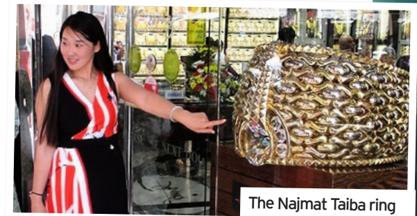
The Najmat Taiba ring

It's a vast collection of artificial islands in the approximate shape of a map of the world, although so far only a few have been developed. Then we flew over the iconic Burj Al Arab, a 'seven-star' hotel on its own man-made island that's shaped like a billowing sail, with curves in all the right places. At 321m, it is higher than the Eiffel Tower and until 2007 it was the tallest hotel in the world. Its helipad and restaurant seem suspended in mid-air. Flying at an altitude of around