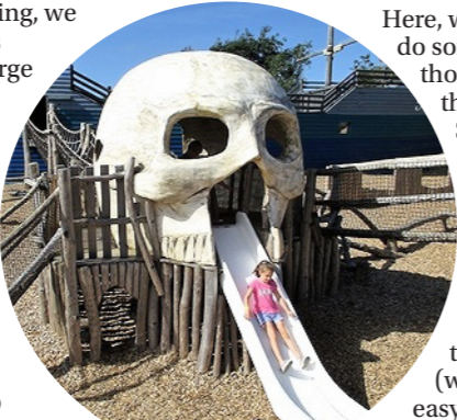
A play area at Folly Farm

From the decking, we watched the kids playing on the large open space opposite, and by night we eyed satellites and shooting stars in the unpolluted skies. And we were able to bring the outside in by simply rolling up the canvas across the full length of tent – with the only wildlife to fear being field mice! We were staying at Noble Court, which is one of three holiday parks in the Celtic family within close proximity – the others being Croft