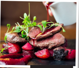
The Qube and one of its delicious dishes