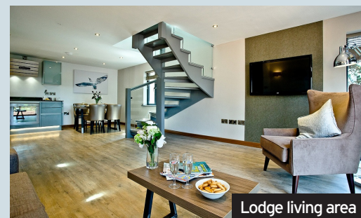
Lodge living area