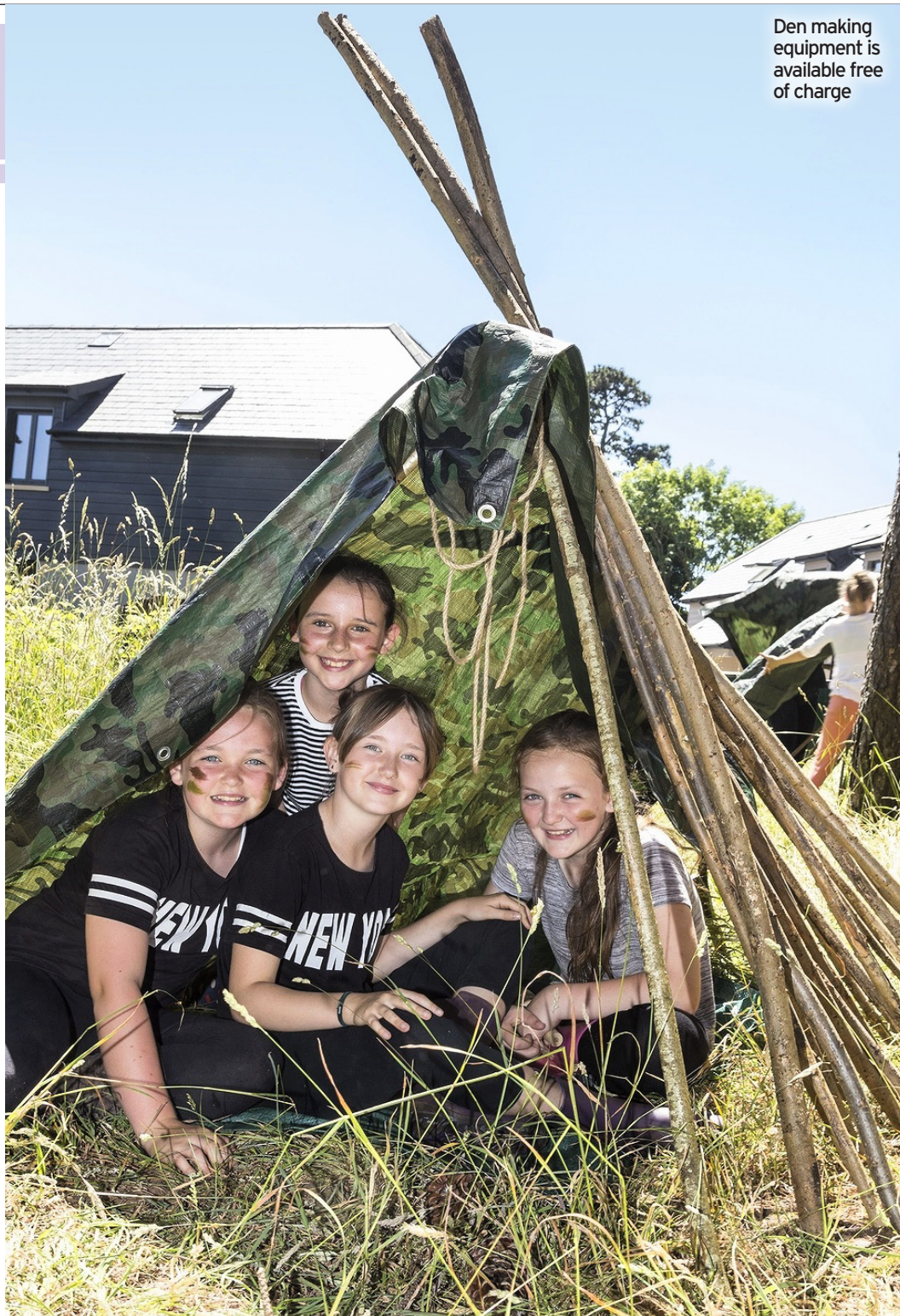
Den making equipment is available free of charge

Our lodge, no.15, was in a woodland setting and came with a large, private decking