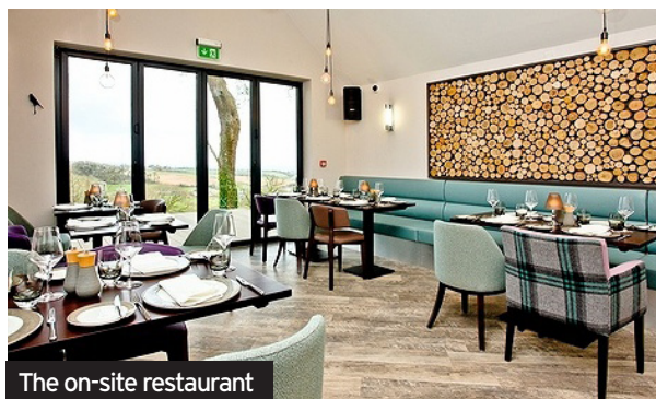
The on-site restaurant

■ MANY lodges are pet friendly, while some have been created with babies in mind. To book, visit beyondescares.co.uk , email behere@beyondescares.co.uk or call 03301 274300.