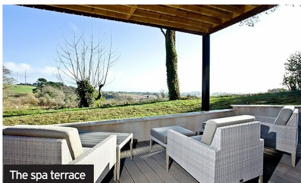
The spa terrace