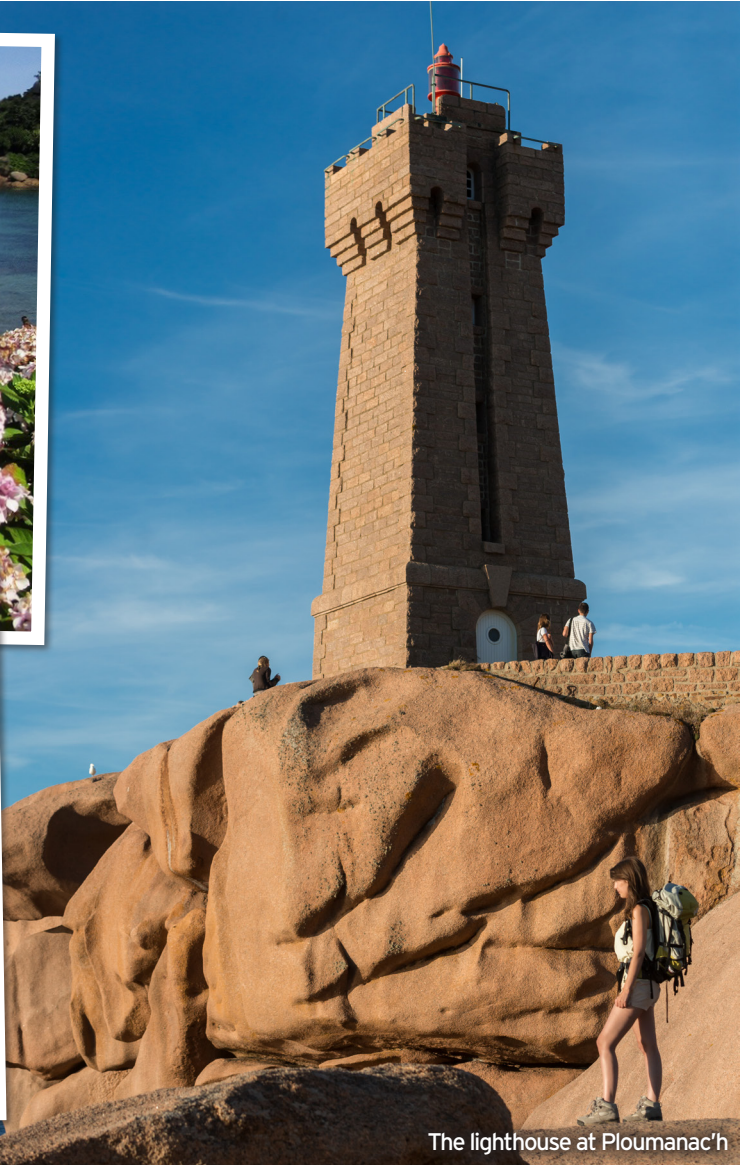
The lighthouse at Ploumanac'h